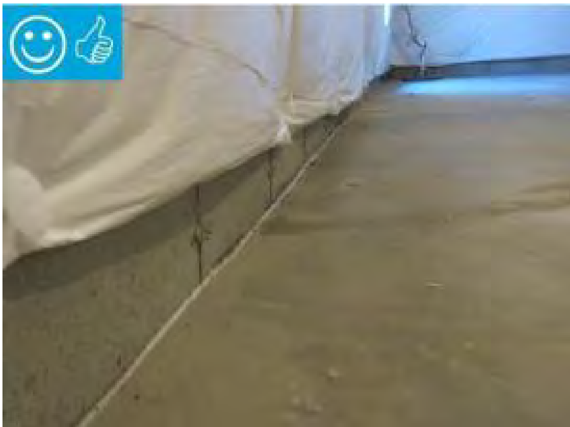
Display Image: WM11013_BasementSpace-1R_BSC_12-19-2013.JPG