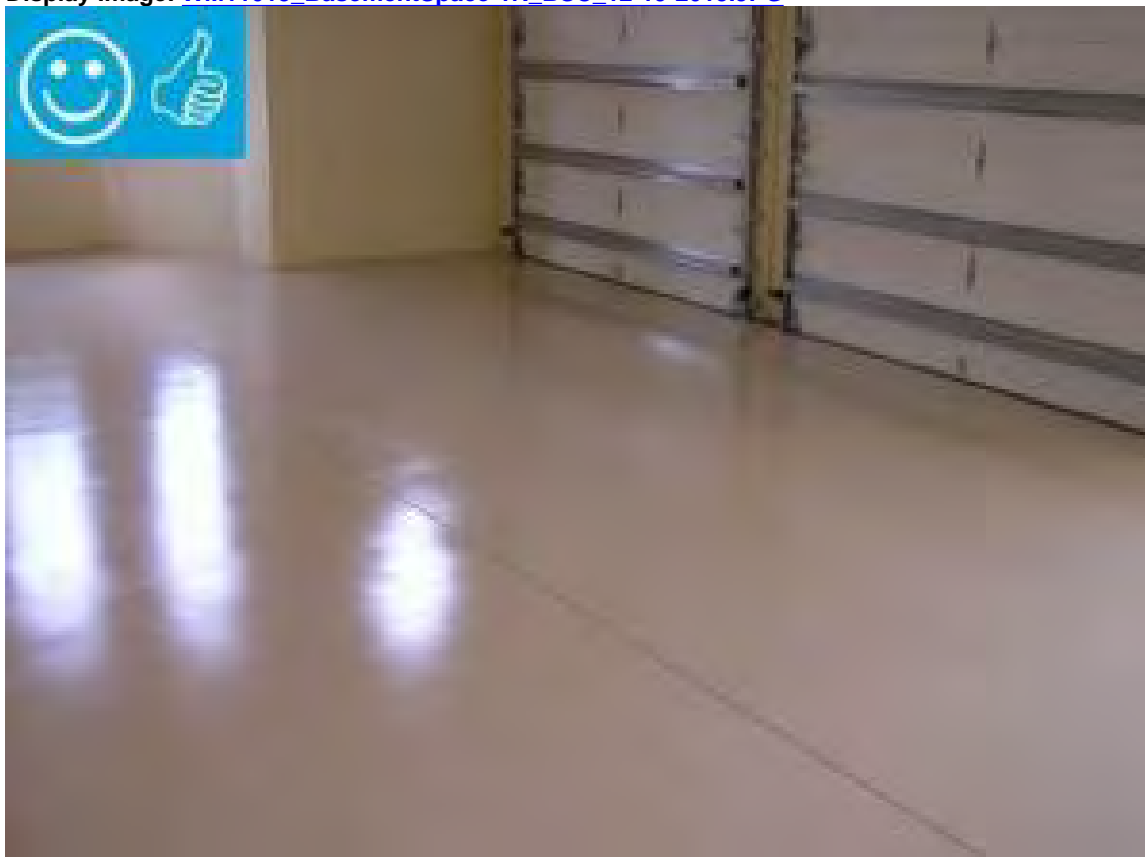
Display Image: WM11013_BasementSpace-2R_BSC_05-20-2008.jpg